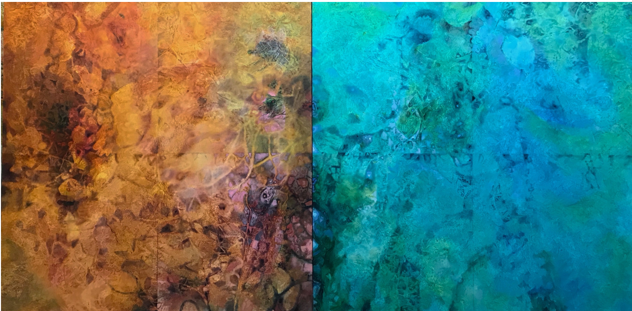
The Qualia 1+1=1a series, acrylic on canvas, 48" x 96".

The Qualia 1+1=1 , diptychs, each an exploration of optical attractions and what is perceived as continuity/discontinuity; how 2 may be perceived as 1. Physics reveals that atoms cannot physically touch one another, that they may however achieve quantum entanglement and attraction. To me this is, aside from interesting science, an ontological and perhaps psychological metaphor for being with another, remaining distinct, not melding into one, being in proximity, remaining intact.