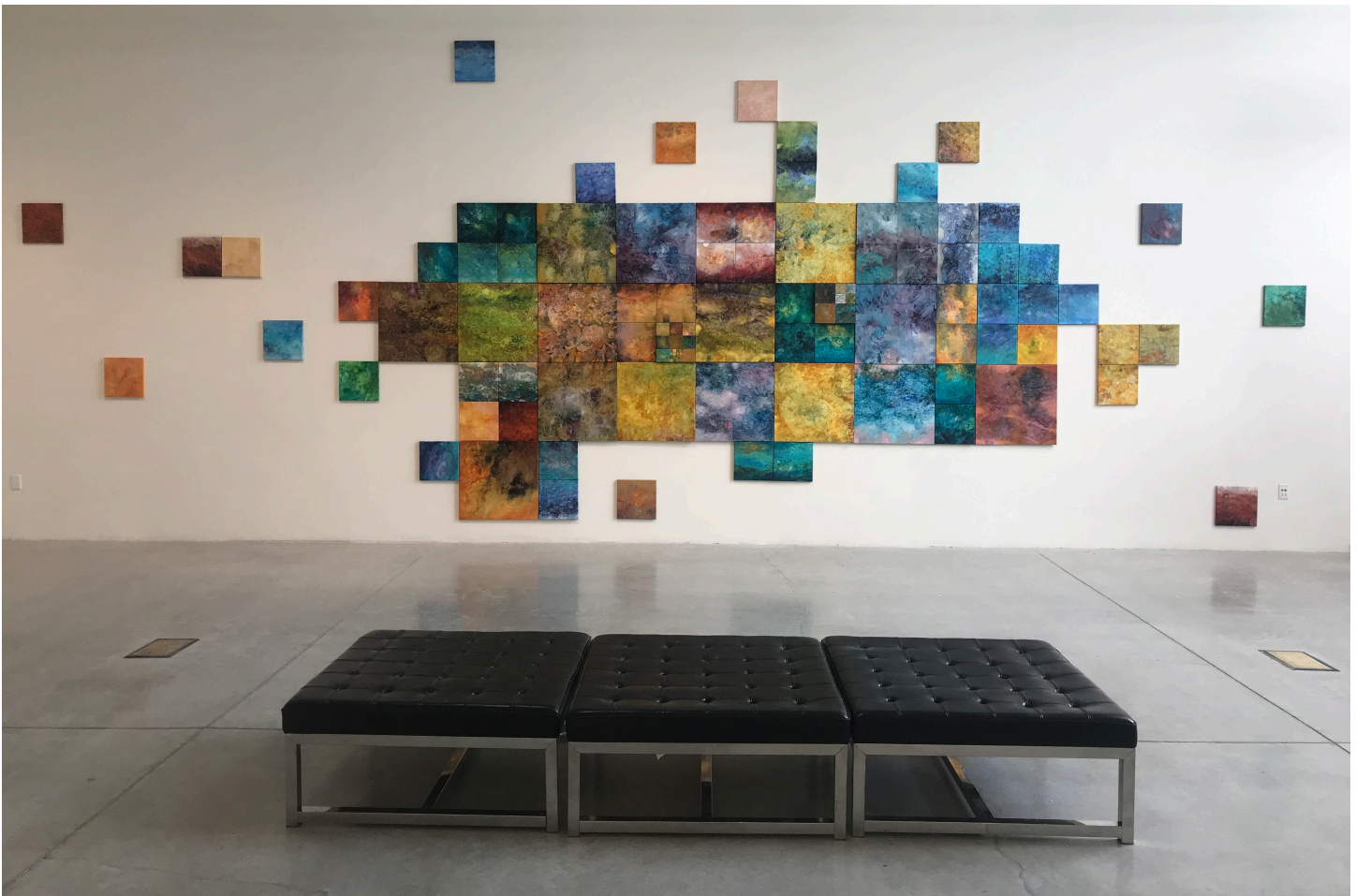
Tesserae @ .125 : .25 : .5 : 1 : 2 : 3 : 4 : 6 : 12 : 24 : 48 : 72 : 96 : 120. Acrylic on canvas, multiple panels.