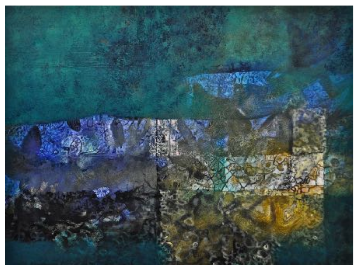
Ephemera (¡Desperta Ferro!), 2013, acrylic on canvas, 32" x 40"