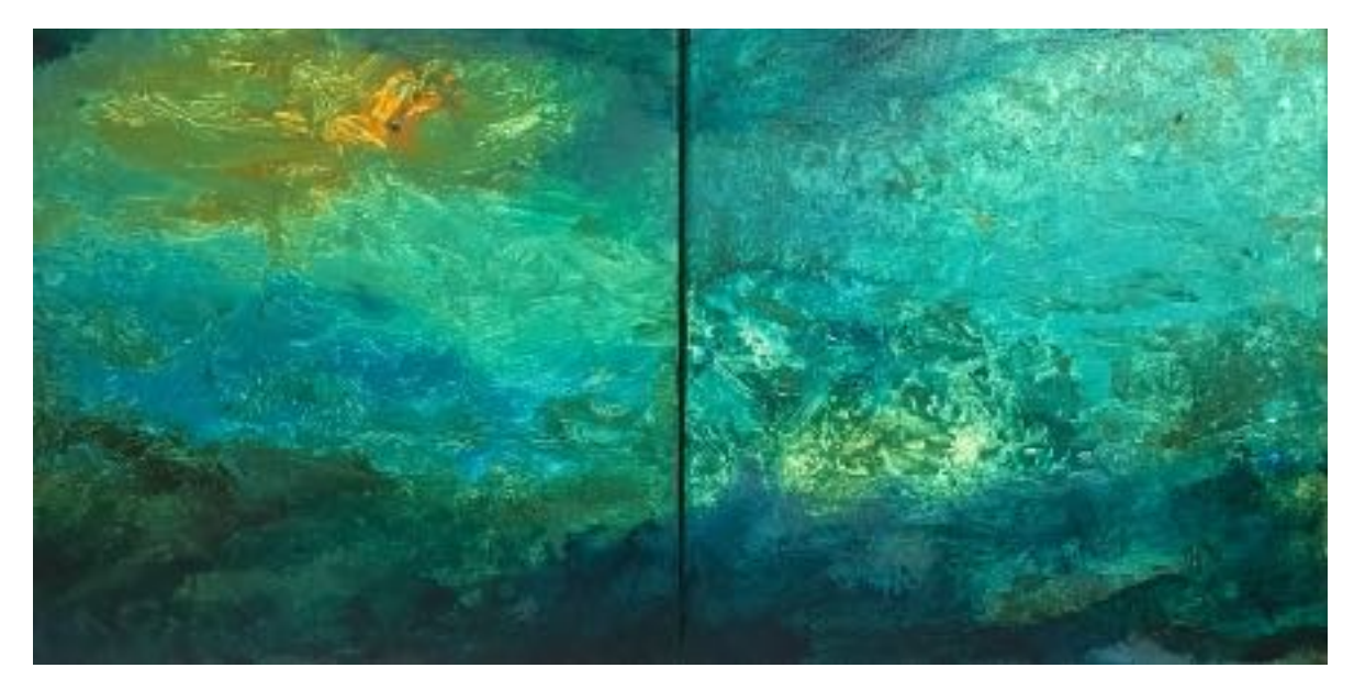
Qualia #1, 2017, acrylic on canvas, 12" x 24"