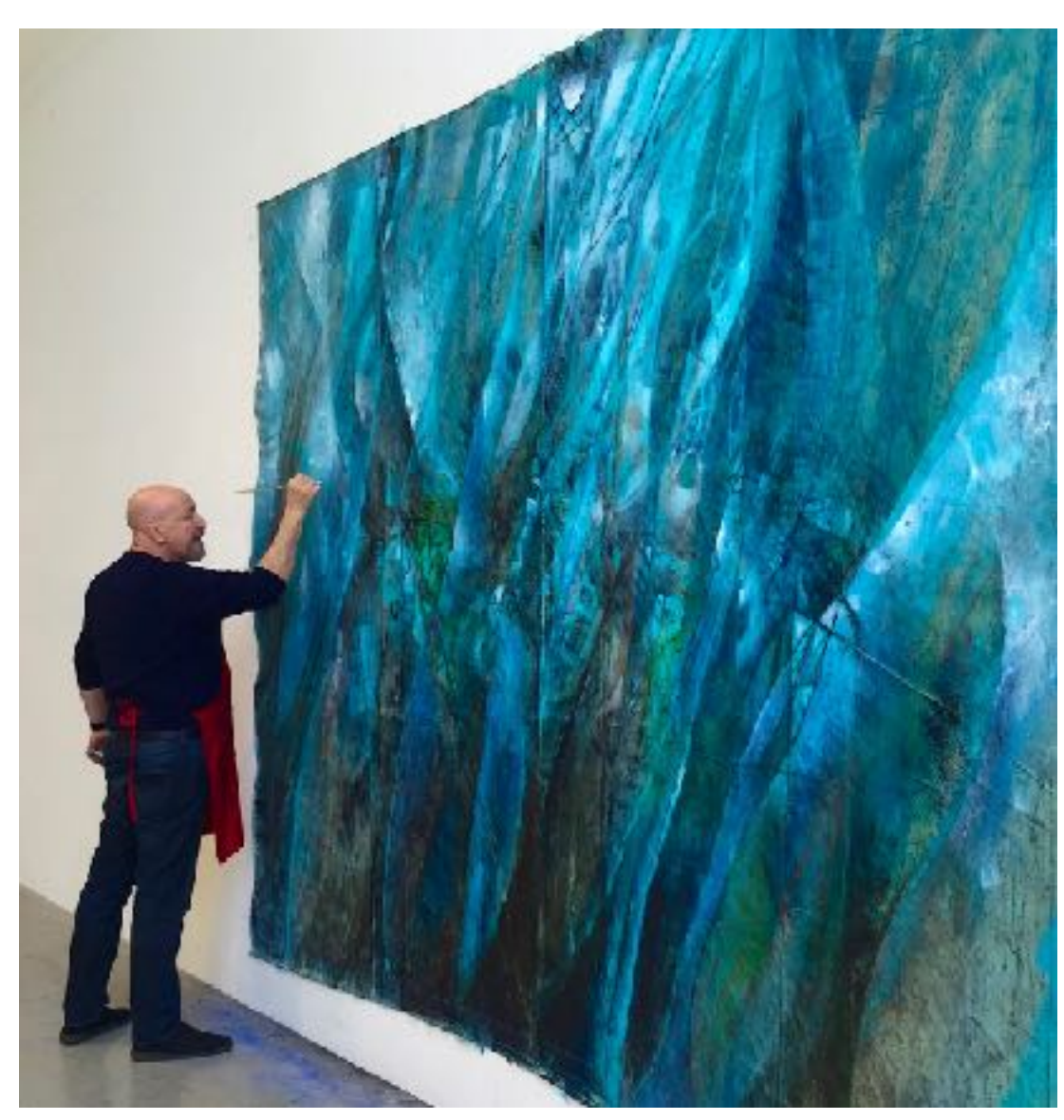
Forest for the Trees, 30-day performance, spring 2015