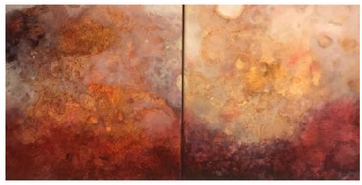
Qualia 7, 2017, acrylic on canvas, 12" x 24{"