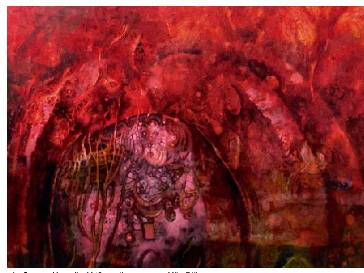
La Caverna Vermella, 2015, acrylic on canvas, 68" x 74"