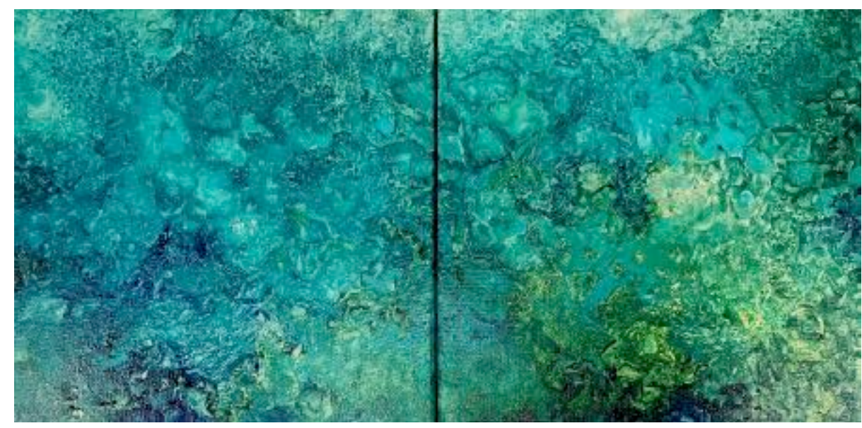
Qualia #17, 2017, acrylic on canvas, 12" x 24"