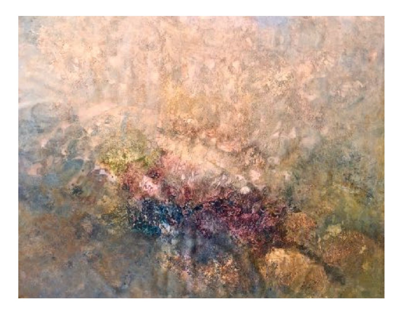
Azurite, 2016, acrylic on canvas, 79" x 72"