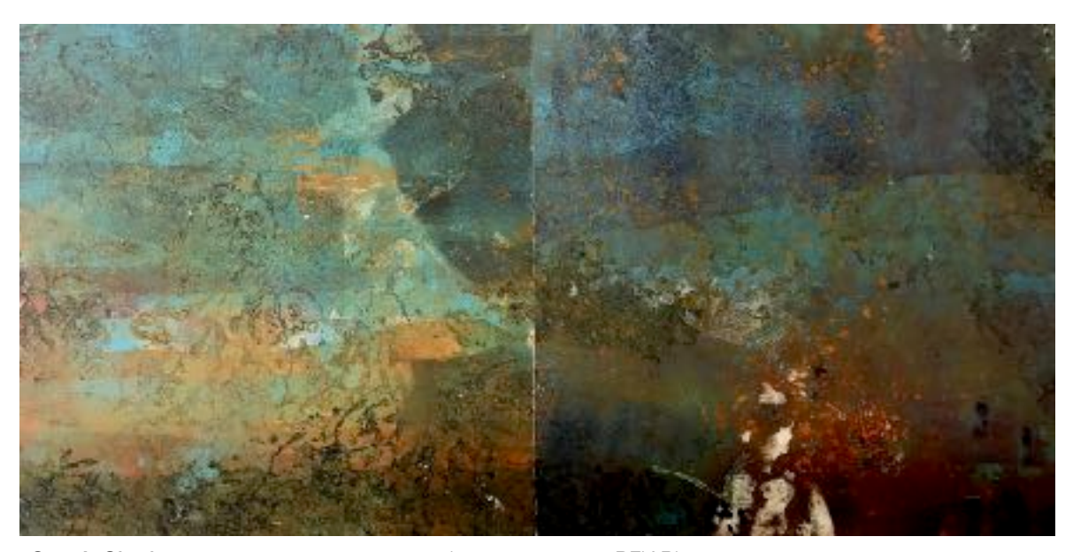
Crow's Shadow 1, 2017, monotype, 12 x 24 image on 22 x 30 BFK Rives cotton paper