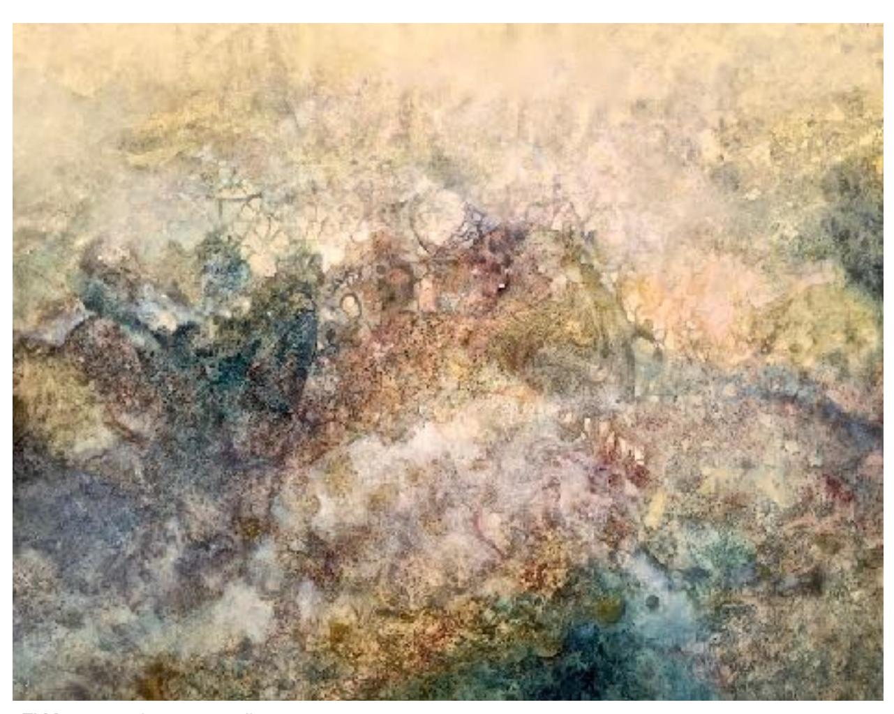
El Maresme #8, 2016, acrylic on canvas, 105 cm x 130 cm