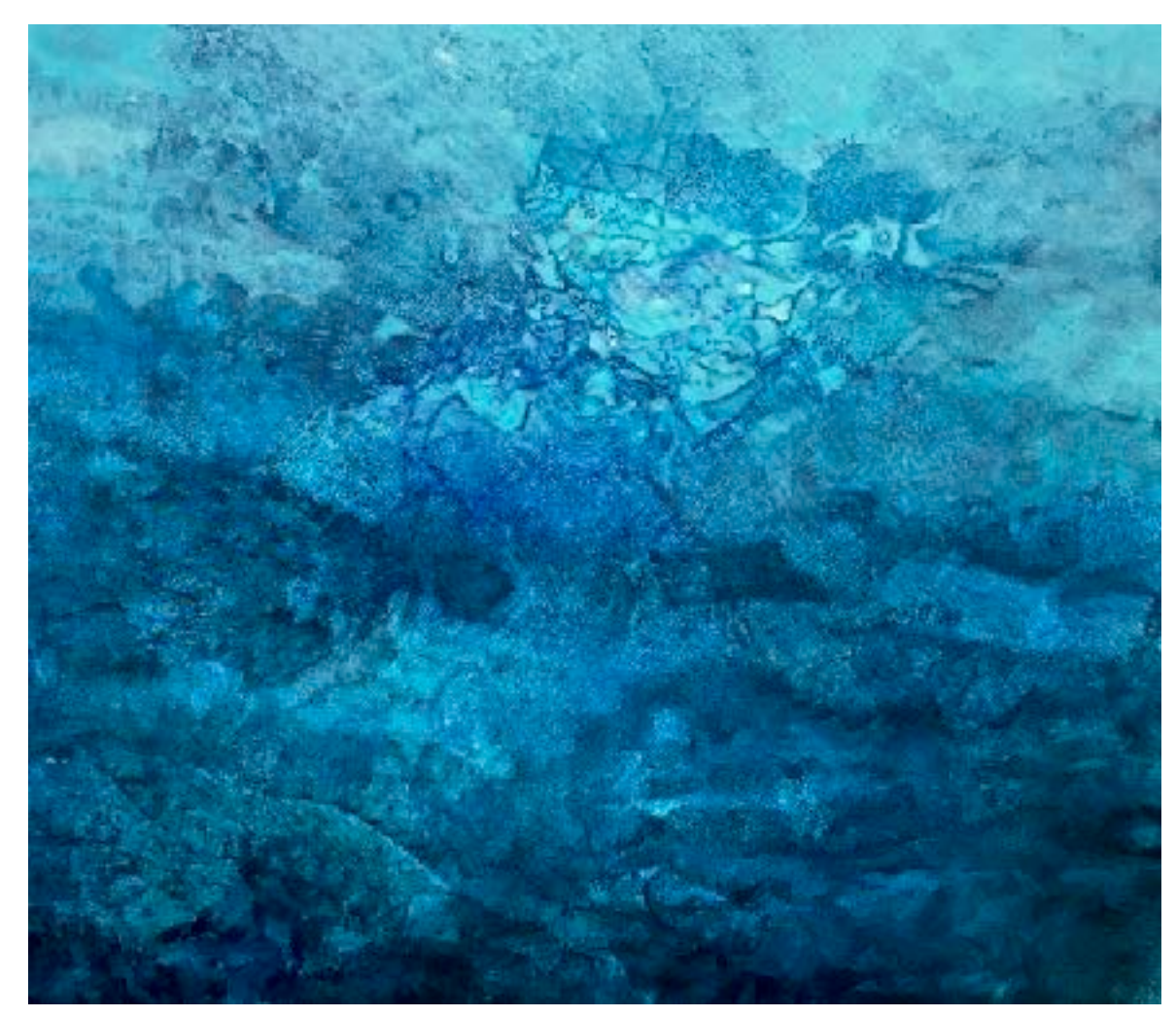
El Maresme, 2016, acrylic on canvas, 90 x 105 cm